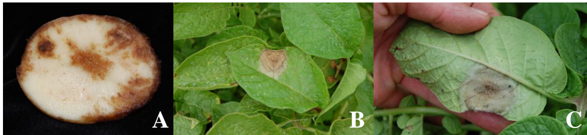
Figure 1. Symptoms of late blight on potato tuber and leaves. A. Note brown-rust colored firm discolored tuber tissue. B. Late blight lesion on potato leaf. Lesions appear brown and papery when weather turns dry or after fungicide use. C. Underside of leaf showing late blight pathogen producing spores.

Disease Description & Status of Disease in WI: Late blight is a potentially destructive disease of tomatoes and potatoes caused by the fungal-like organism, Phytophthora infestans . This pathogen is referred to as a ‘water mold’ since it thrives under wet conditions. Symptoms of tomato or potato late blight include leaf lesions beginning as pale green or olive green areas that quickly enlarge to become brown-black, water-soaked, and oily in appearance (Figure 1). Lesions on leaves can also produce pathogen sporulation which looks like white-gray fuzzy growth (Figure 1, 2). Stems can also exhibit dark brown to black lesions with sporulation. Fruit symptoms begin small, but quickly develop into golden to chocolate brown firm lesions or spots that can appear sunken with distinct rings within them (Figure 2); the pathogen can also sporulate on tomato fruit giving the appearance of white, fuzzy growth. The time from first infection to lesion development and sporulation can be as fast as 7 days, depending upon the weather. In WI, late blight has been identified on tomatoes and potatoes since in each of the last 4 years. On June 28, 2013, we confirmed late blight on potato in Adams County, Wisconsin. It is important to protect susceptible crops with fungicides in both conventional and organic production systems.